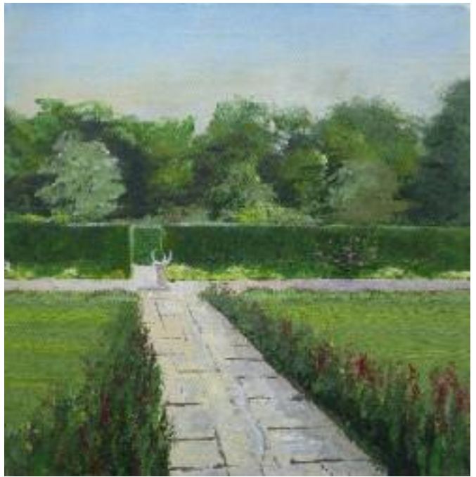
Formal Garden Mike Griffiths